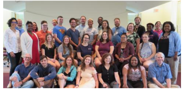
NBA XPLOR 2019-20 Cohort, with Staff and Spiritual Companions

The National Benevolent Association (NBA) initiates ministries designed to establish and grow partnerships with health and social service supporters and providers and have extended the application deadline for the NBA XPLOR program.